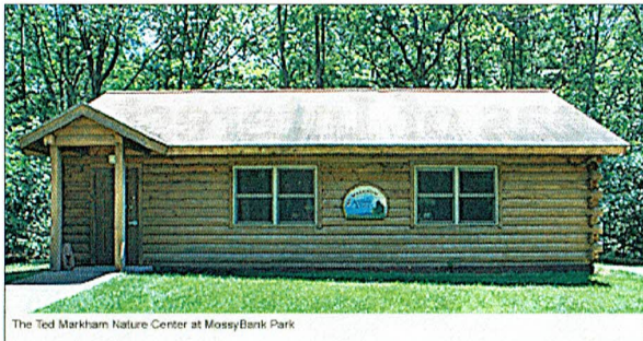
The Ted Markham Nature Center at MossyBank Park

Sitting high on a hillside on the southern end of the village of Bath, Mossy Bank Park consists of picnic & play areas, hiking trails, a five acre pond, the Ted Markham Nature Center, & an overlook that provides an incredible panoramic view of Bath & the Conhocton Valley. Open from 10 AM to 10 PM from May 1st to October 14th, the park encompasses 168 mostly wooded acres. In recent years the area has become popular with hang gliders.